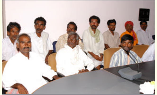
Farmers listening to the advantages of growing sweet sorghum during the interactive meeting

NRCS on 24 June 2005. About 50 farmers including resource persons from MV foundation