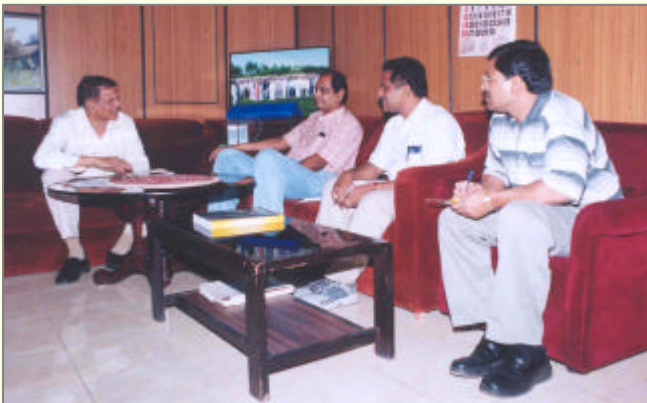
Director, NRCS discussing about the possibilities of commercialization of sweet sorghum with officials of MV foundation and Winrock International

A farmer's interaction meeting was organized at