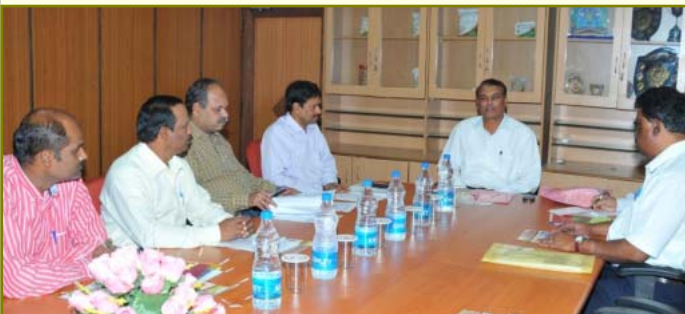
The NSP monitoring team members discussing about status of sorghum seed production, revenue generation and status of licensing and commercialization of sorghum hybrids

The members of National Seed Production monitoring team led by Dr Vilas A Tonapi, Head DSST, IARI visited DSR on 3 December 2011 to review the sorghum breeder seed