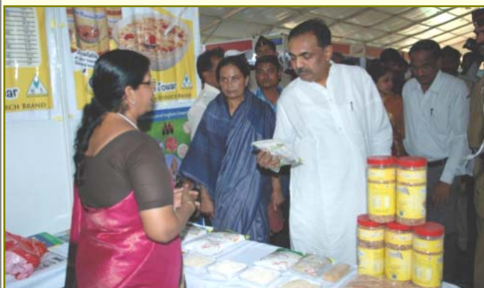
Visitors appreciating novel food products of Sorghum

Directorate of Sorghum Research set up a sorghum stall during "National conference on Krishi Vigyan Kendra", which was held at JNKVV, Jabalpur on 04 -05 December, 2011. More than 200 farmers and other staff members visited the sorghum stall. The importance of sorghum as health and nutritious food was explained to them and the