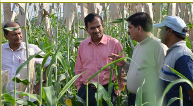
NBPGR Scientists Visited Sorghum Genetic Resources Multiplication Field