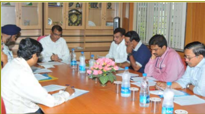
ITMC Members discussing about licensing and commercialization activities at DSR