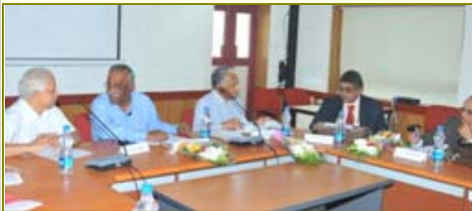
The NFBSFARA meet in progress