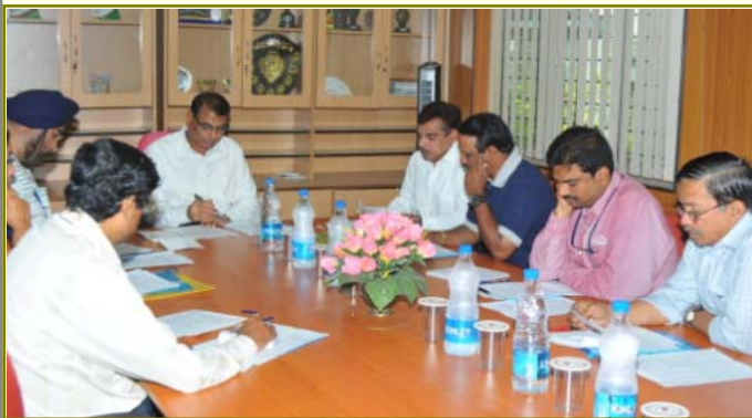
ITMC Members discussing about licensing and commercialization activities at DSR