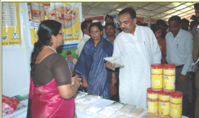
Visitors appreciating novel food products of Sorghum

Directorate of Sorghum Research set up a sorghum stall during "National conference on Krishi Vigyan Kendra", which was held at JNKVV, Jabalpur on 04 -05 December, 2011. More than 200 farmers and other staff members visited the sorghum stall. The importance of sorghum as health and nutritious food was explained to them and the