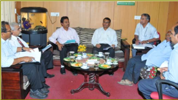
Director, DSR, making a point to the Institute Management Committee members

The 22 nd Institute Management Committee (IMC) meeting