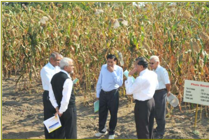
The RAC members being demonstrated newly developed Varieties in the demonstration field

The XIII Research Advisory Committee Meeting was held at DSR on 15 February, 2012 under the chairmanship of Dr.