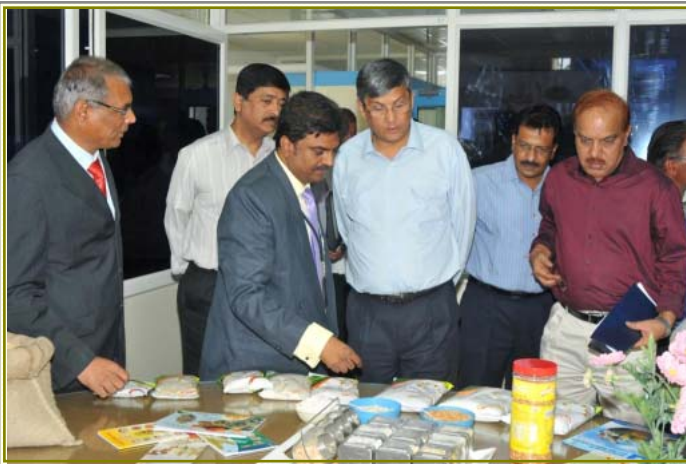
Visitors show keen interest in the novel food products of Sorghum

sealed at controlled temperatures. Sorghum roties are ready-to-eat, and can be kept for 24 hours without refrigeration. DSR makes it possible for caterers, restaurants, and event planners to purchase in bulk at highly attractive prices under the promotional activity. This centre would also serve as a training centre for the new enthusiastic entrepreneurs from urban areas and would benefit rural women who are interested to undertake the sorghum foods marketing as their profession.