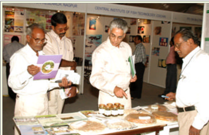
Visitors at the NRCS stall enquiring about the alternate uses of sweet sorghum