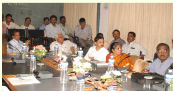
DBT review meeting under progress

Progress in the network project on millets biotechnology was reviewed at NRCS on 19 January, 2006 along with the other related biotechnology projects in operation at this centre.