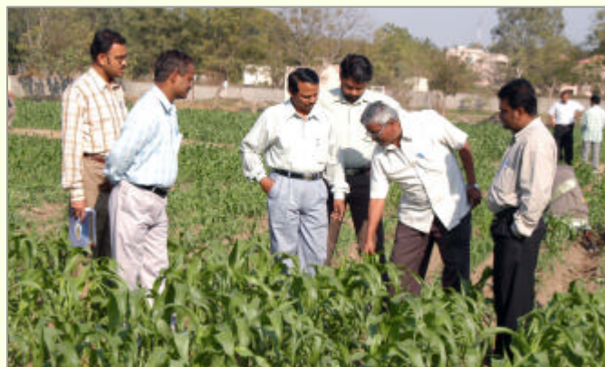
Participants observing sorghum germplasm lines collected from Sudan

Model training course on “Seed production, processing and marketing of sorghum and other major millets”, was