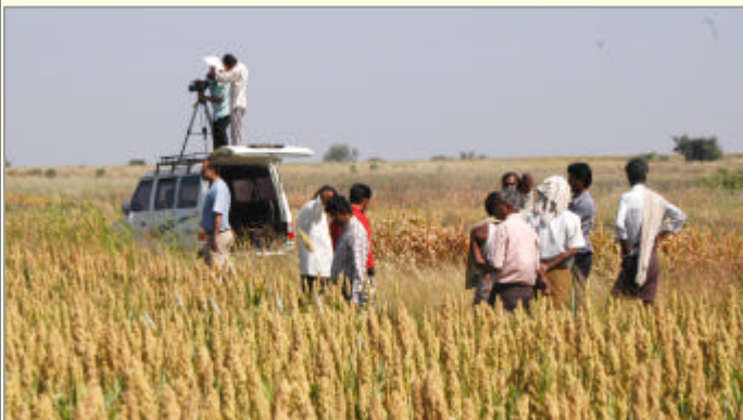
Video filming of seed production plot in progress at farmers field in Bellary

The digital video coverage of sequences relating to sorghum seed production was recorded at seed