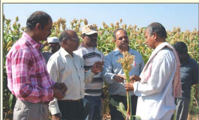
Breeder Seed plot of SSV 84 being monitored by DSR scientists

The sorghum breeder seed plots of CSV 15, CSV 17, CSV 20, SSV 84, CSV 24 SS, ICSA 38, CSV 22 at Kurnool, Adoni, Mantralayam and Mahaboobnagar were monitored by team of DSR scientists, officials from Andhra Pradesh State Seed Certification agency and National Seeds Corporation