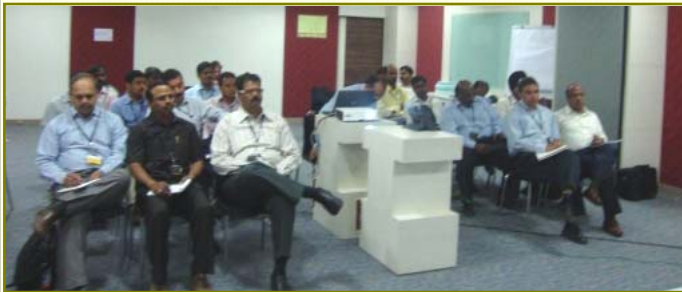
Two day programme on "Theoretical and Practical aspects of Plant variety protection in India" in progress

DSR under the aegis of Syngenta India Ltd. Pune organized a two day programme on "Theoretical and Practical aspects of Plant variety protection in India". The plant breeders from