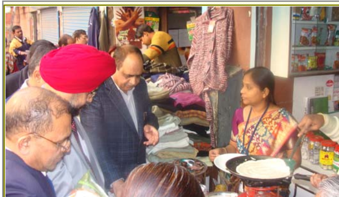
Overwhelming response seen at the sorghum stall

An exhibition was organized as a part of promotional activity for creating awareness on sorghum foods and sorghum ready-to-eat foods at NAFED Outlets in New Delhi between 21 -25 January 2011. In this exhibition DSR displayed the posters, danglers and flour stacker and samples of processed products of sorghum. A large number of participants encompassing policy makers, scientists, private sector delegates, students and farmers visited the stall. Exhibition on sorghum foods has received appreciations from the audience. At this stall wet sampling and ready-to-eat Idly, dosa were demonstrated to the customers and