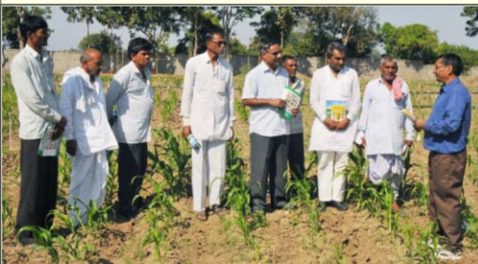
Farmers being appraised about the latest cultivation practices