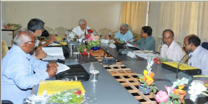
The XX IMC meeting in progress