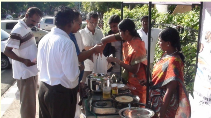
Brisk sale of sorghum based products seen at the road shows

As a part of continuous promotional activity of Jowar products under NAIP subproject "Creation of demand for millet foods through PCS value-chain," road-shows were