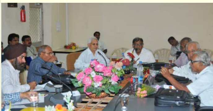
The XI RAC meeting in progress