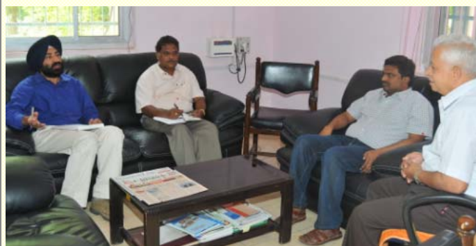
Discussion in progress on possible collaboration with CIPHET