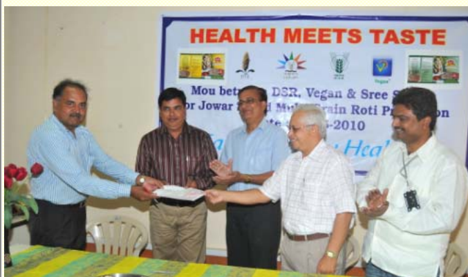
MoU signing between DSR and M/s Vegan foods