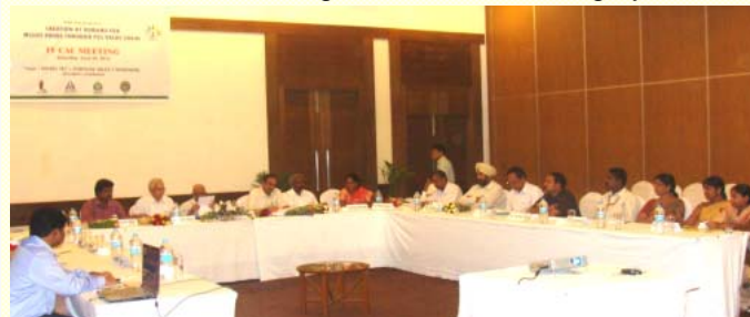
The Consortium Advisory Committee meeting in progress