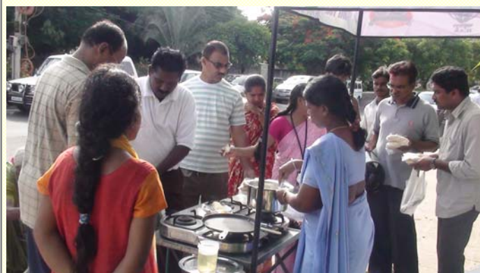
Overwhelming response seen for jowar foods at road shows