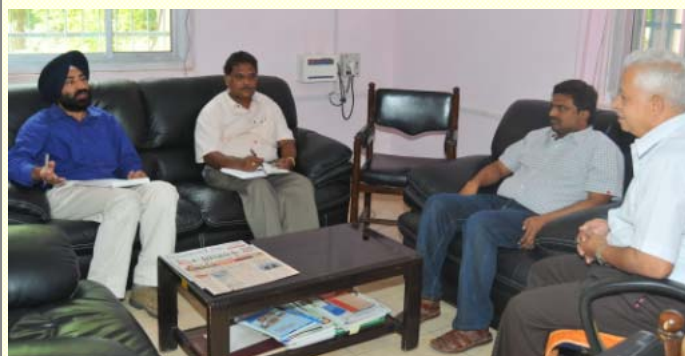
Discussion in progress on possible collaboration with CIPHET