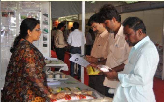
Visitors show keen interest in sorghum based products

DSR setup the sorghum stall in the exhibition "Agritech-2010" organized at ANGRAU from 15 -18 June, 2010, where sorghum and other millet foods were displayed.