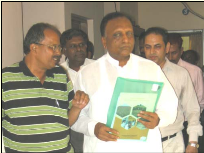
Prof. Laxmanrao Dhobale, Honorable Cabinet Minister, being briefed about the institute activities

Prof. Laxmanrao Dhobale, Honorable Cabinet Minister, for Water Supply and Sanitation, Government of Maharashtra, visited the Centre on Rabi Sorghum (DSR) on 30 June 2011.