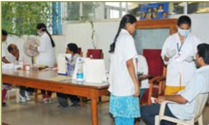
The dental camp in progress

M/s. Rukku's Dental Hospital, Hyderabad organized a free dental check-up camp at DSR on 7 June, 2011. This programme was extended to all categories of DSR staff. More than 100 staff members utilized this opportunity.