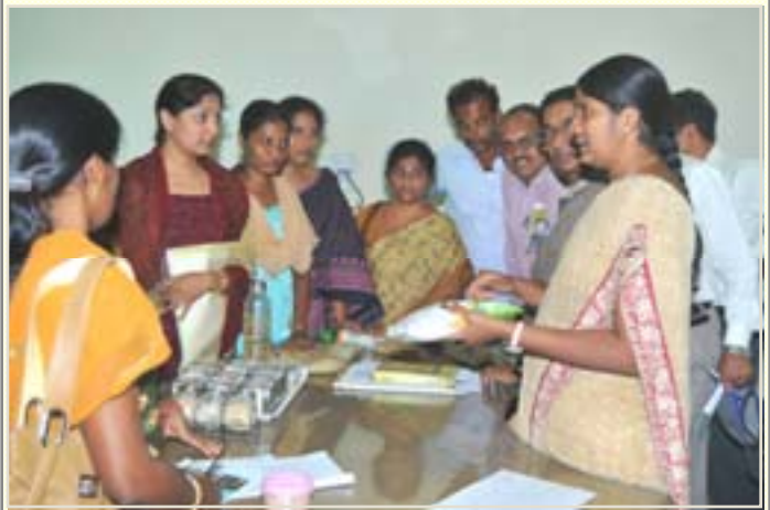
Recipes of novel sorghum foods being explained to farm women

provided to them. They also visited food processing lab