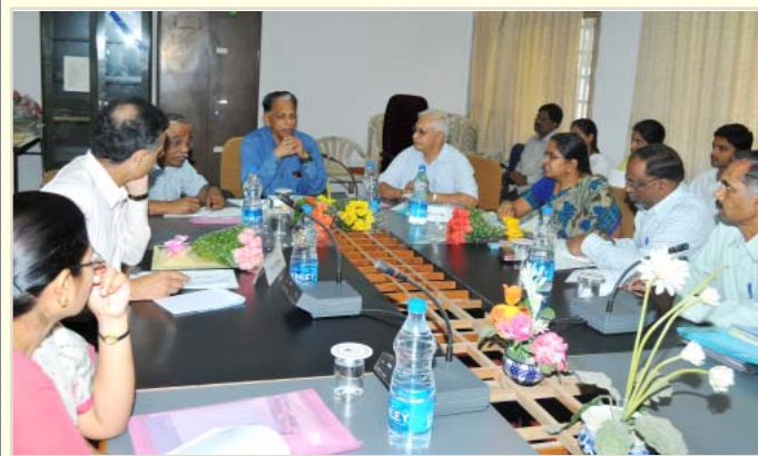
Deliberations in progress during the meeting