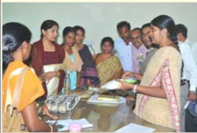
Recipes of novel sorghum foods being explained to farm women

provided to them. They also visited food processing lab