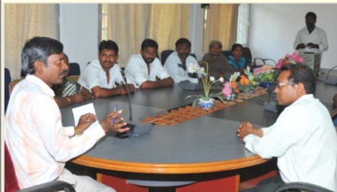
Package of practices in sorghum being explained to farmers