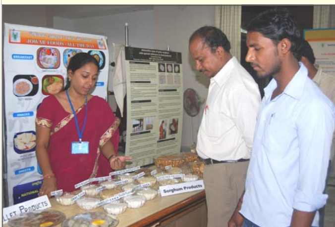
Visitors show keen interest in sorghum based products set-up by DSR