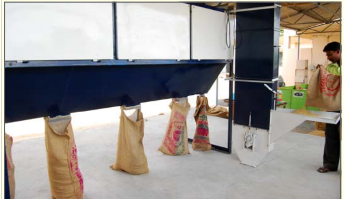
The seed grader in operation

The institute has acquired one new grain grading and processing unit to improve the grain quality and shelf-life.