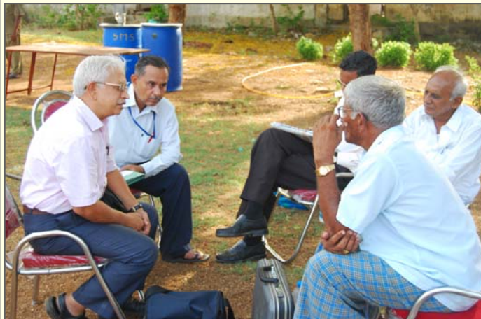
Farmers interacting about the intricacies of growing sorghum in rice-fallows with NRCS scientists

in rice-fallows during rabi in central coastal districts of Andhra Pradesh. In this event, along with 300 farmers, scientists from Regional Agricultural Research Station, Lam; Agriculture College, Bapatla and District Agricultural