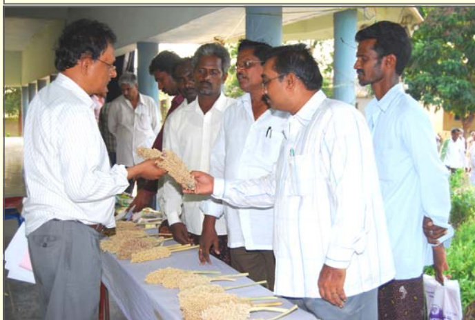
Farmers keenly observing the newly developed sorghum cultivars

तेनाली में कृषक दिवस : ज्वार अनुसंधान निदेशालय ने 18 मई 2009 को आंध्र प्रदेश में गुंटुर जिले के तेनाली के समीप अनंतवरम ग्राम में कृषक दिवस का आयोजन किया। ज्वार की खपत एवं खेती के गैर-पारंपरिक क्षेत्र में पहली बार ज्वार प्रक्षेत्र दिवस का आयोजन किया गया। इस प्रक्षेत्र दिवस का मुख्य उद्देश्य आंध्र प्रदेश के केंद्रीय तटवर्ती जिलों में चावल-परती रबी फसल के रूप में ज्वार को प्रस्तुत करना था। इस कार्यक्रम में 300 कृषकों के अलावा क्षेत्रीय कृषि अनुसंधान केंद्रों, लैम; कृषि महाविद्यालय, बापट्ला तथा जिला प्रशिक्षण केंद्रों से वैज्ञानिकों, राज्य कृषि विभाग अधिकारियों, पंचायतराज कार्मिकों, उर्वरक वितरकों, प्रेस तथा दूरदर्शन मीडिया ने सक्रीय रूप से भाग लिया। चावल-परती रबी फसल के रूप में ज्वार की खेती करने वाले कई कृषकों ने अपने अनुभवों का आदान-प्रदान किया तथा ज्वार अ.नि. से निवेदन किया कि वह उनके गांव में एथनॉल तथा शरबत प्रसंस्करण एककों की स्थापना करें।