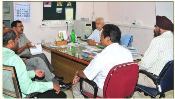
Discussions in progress for possible sharing of technical know-how between the institutes