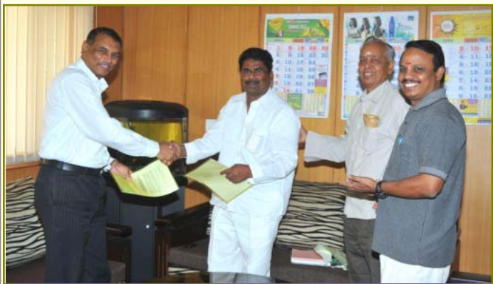
Happenings at DSR and AICSIP news No. 104; May, 2012

A Memorandum of Agreement (MoA) was signed