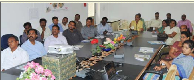
Visitors keenly listening to the video on research and development activities of sorghum

A team of 16 Assistant Directors from different districts of Agriculture and Horticulture department, Government of Andhra Pradesh visited