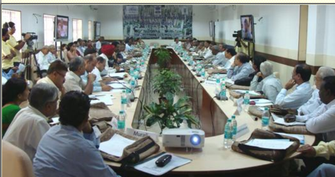
National Brainstorming Workshop for Promoting Millets in progress