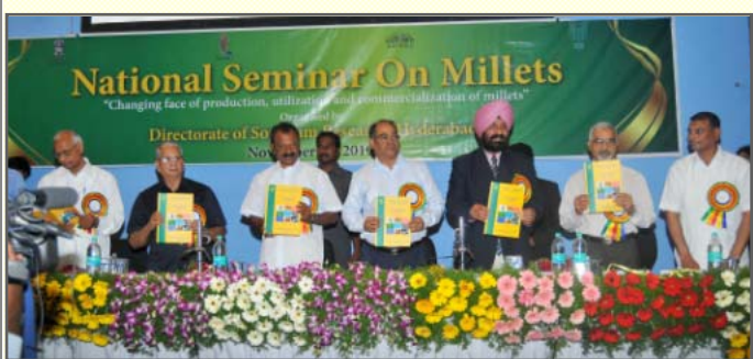
Shri Raghuvveera Reddy, MoA (AP), releasing a publication "Recent trends in production utilization and trade of sorghum in India"

This book gives a brief account on comprehensive study on profiling and market analysis of sorghum globally and in India including