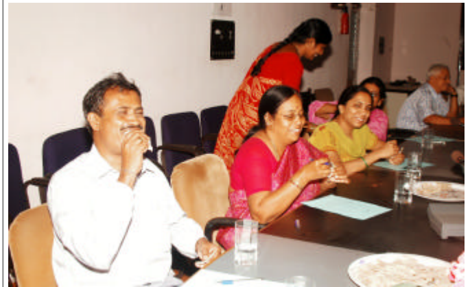
Tasting panel for roti quality evaluating different quality traits

Roti taste and quality evaluation is an essential prerequisite for releasing rabi sorghum cultivars. Taste of roti from elite stocks of sorghum was evaluated with a trained taste panel, comprising a group of people who,