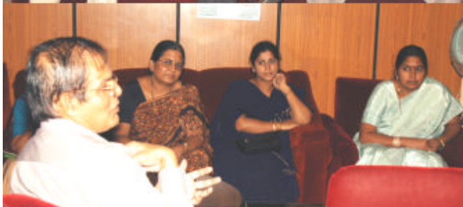
Benefits of millets being discussed with panel of Doctors from Bhaskara Medical College

Consultant surgeon, visited NRCS on 31 Oct, 2006. They had a detailed discussion with Director and scientists of NRCS on promotion of Sorghum as a potential health food. They discussed on the benefits due to nutraceutical properties, and lack of gluten content of sorghum. It was felt that there is a need to enhance the already taken initiatives to popularize the sorghum as best food for diabetics. They also discussed means to promote sorghum in the millet-based food products,