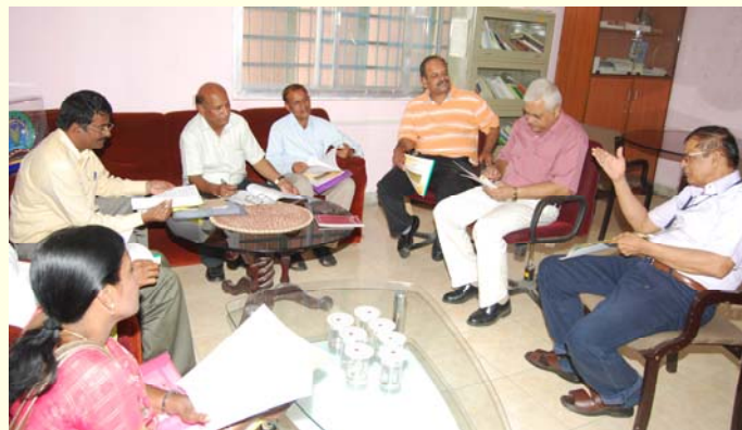
Director, NRCS making a point on seed marketing issue