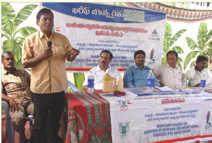
Farmers field day at Mannur organized under NAIP

NRCS and ITC Ltd. Adilabad jointly organized a "Farmers' field day" at Mannur village, Adilabad District