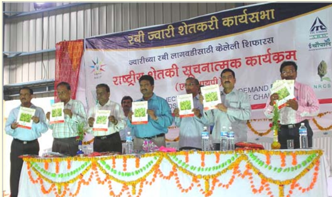
Book on "Package of Practices for improved rabi sorghum cultivation" being released at NAIP launching workshop

Launching workshop on "Intensive rabi cultivation for sorghum end-uses" was organized by NRC Sorghum and ITC Ltd at Parbhani on 6 October 2008. More than 450 farmers attended the workshop. Sh. JunJun Patil, District