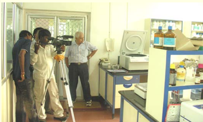
Video coverage of NRCS activities

Telemedia with his crew organised the video shooting. The team covered various research activities of the institute at laboratory and in field level. They covered activities at pathology, alternate uses, MAS and,