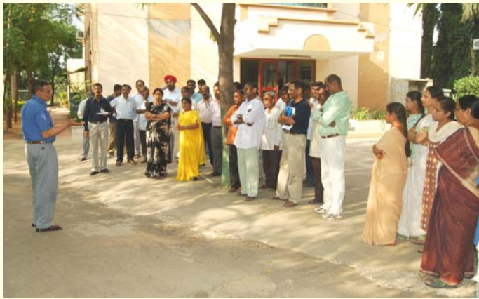
Director, NRCS addresses the staff on the eve of world food day

improvement of grain quality and digestibility.