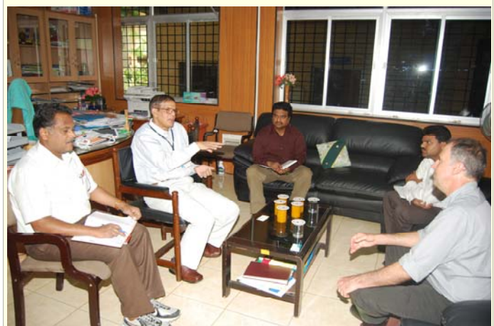
Discussion on sustainable biofuel production from sweet sorghum