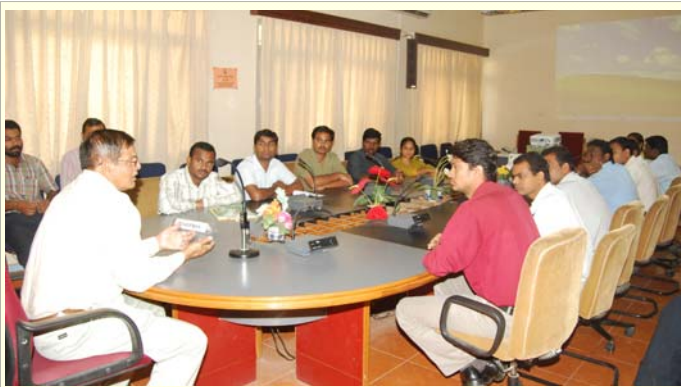
The ARS trainees being motivated by Director, NRCS