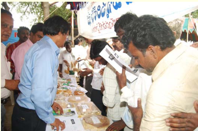
Visitors flocking NRCS’s sorghum stall at DRR rice field day

NRC Sorghum set up a stall in the exhibition organized during “Farmers’ day”, which was held at Directorate of Rice Research, Hyderabad on 25 October, 08. More