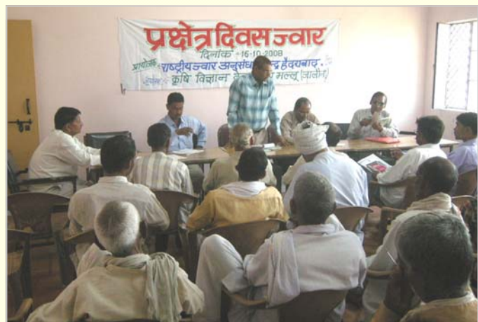
Farmers meet at Jaulon village