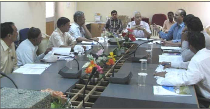
Seed production activities and progress made under BSP being explained