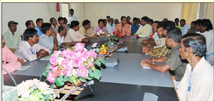
Sorghum as a health food being discussed with farmers from Tripura

A group of 69 progressive farmers from Tripura visited DSR on Oct.10, 2009 to get familiarized with the sorghum crop and its relevance. Director presented an overview of sorghum research and alternative uses of this crop. They were exposed to the