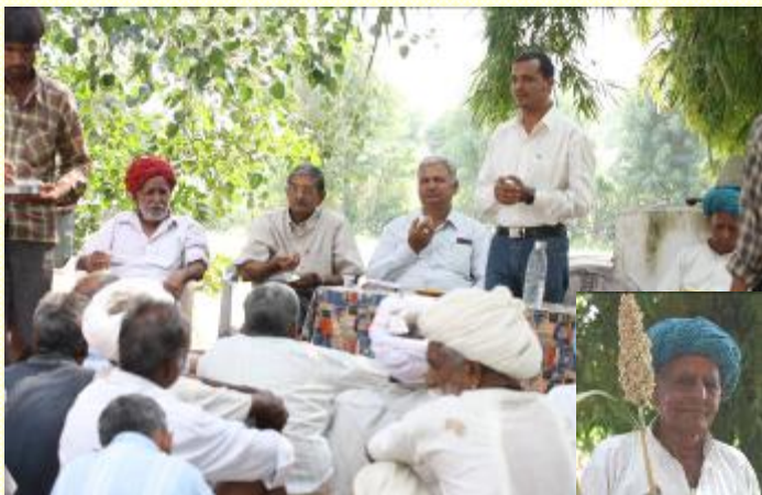
Dr. RR Chapke addressing Udaipur farmers

Sorghum field day was organized at Intali village in Udaipur district on the farmer's field by the AICSIP Udaipur on 12 October, 2010. A group of 50 sorghum farmers including the