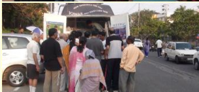
Road show of sorghum healthfoods at Hyderabad