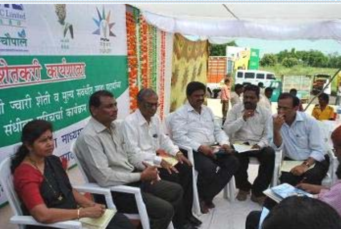
Discussion session with stake holders during NAIP rabi programme