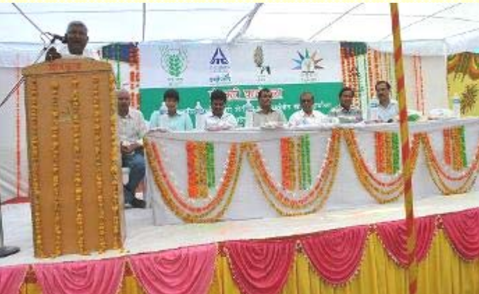
A snap shot of rabi sorghum workshop at Parbhani

DSR and the Agri. Business Division of ITC Ltd., jointly organized Farmers Orientation Workshop entitled "Intensive Market Led Rabi Sorghum Cultivation & Value Addition Opportunities" at Parbhani on 4 Oct., 2010