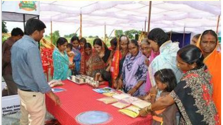
Demonstration of novel sorghum food products