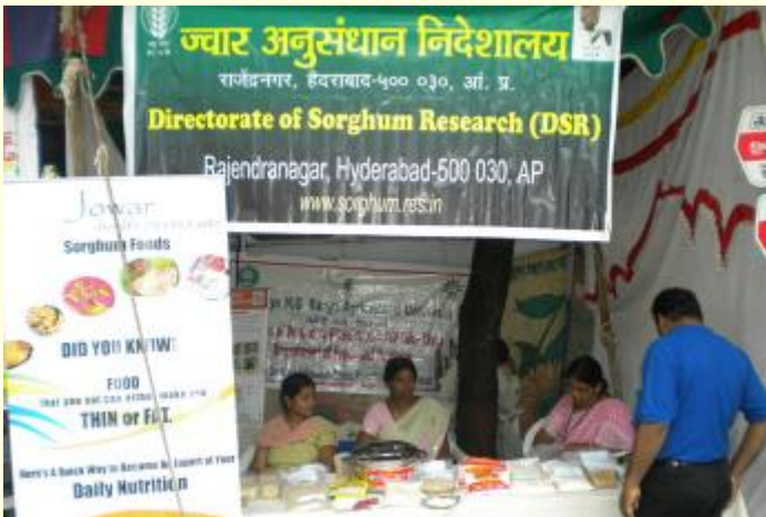
A view of DSR sorghum stall at DRR

DSR set up a “Sorghum health food stall” at Farmers’ Day organized by Directorate of Rice Research (DRR), Hyderabad on 24 Oct., 2010 to create awareness about sorghum