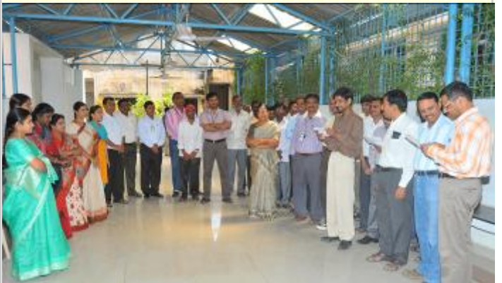
DSR staff taking oath on vigilance awareness week