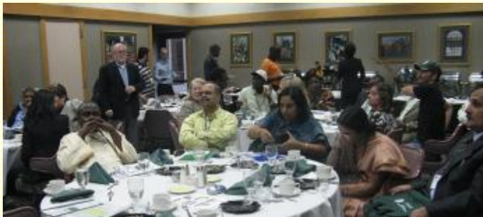
A view of training session in progress at Michigan State University