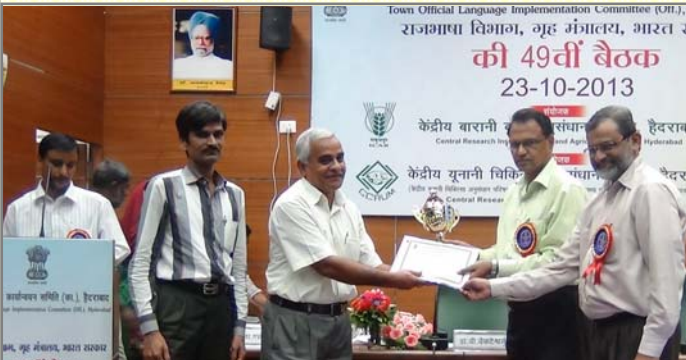
Happenings at DSR and AICSIP news No. 121; September, 2013

DSR's annual in-house magazine "Jowar Sourabh" (Vol. 3) bagged the first prize under "Best Hindi Annual Journal 2012-13" category