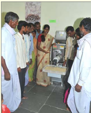
A demonstration for making sorghum macaroni being imparted to the farmers

A training programme on "Sorghum food processing & entrepreneurship" was organized at DSR Hyderabad during 16-18 August, 2010 for the farmers as a part of entrepreneurship development programme under NAIP subproject "Creation of demand for millet foods through PCS value. This 3 days specialized programme was organized exclusively for the farmers from Parbhani district of Maharashtra. Total 16 farmers including 5 women